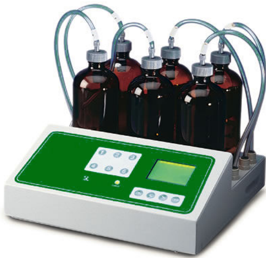
Madmic ® Digital